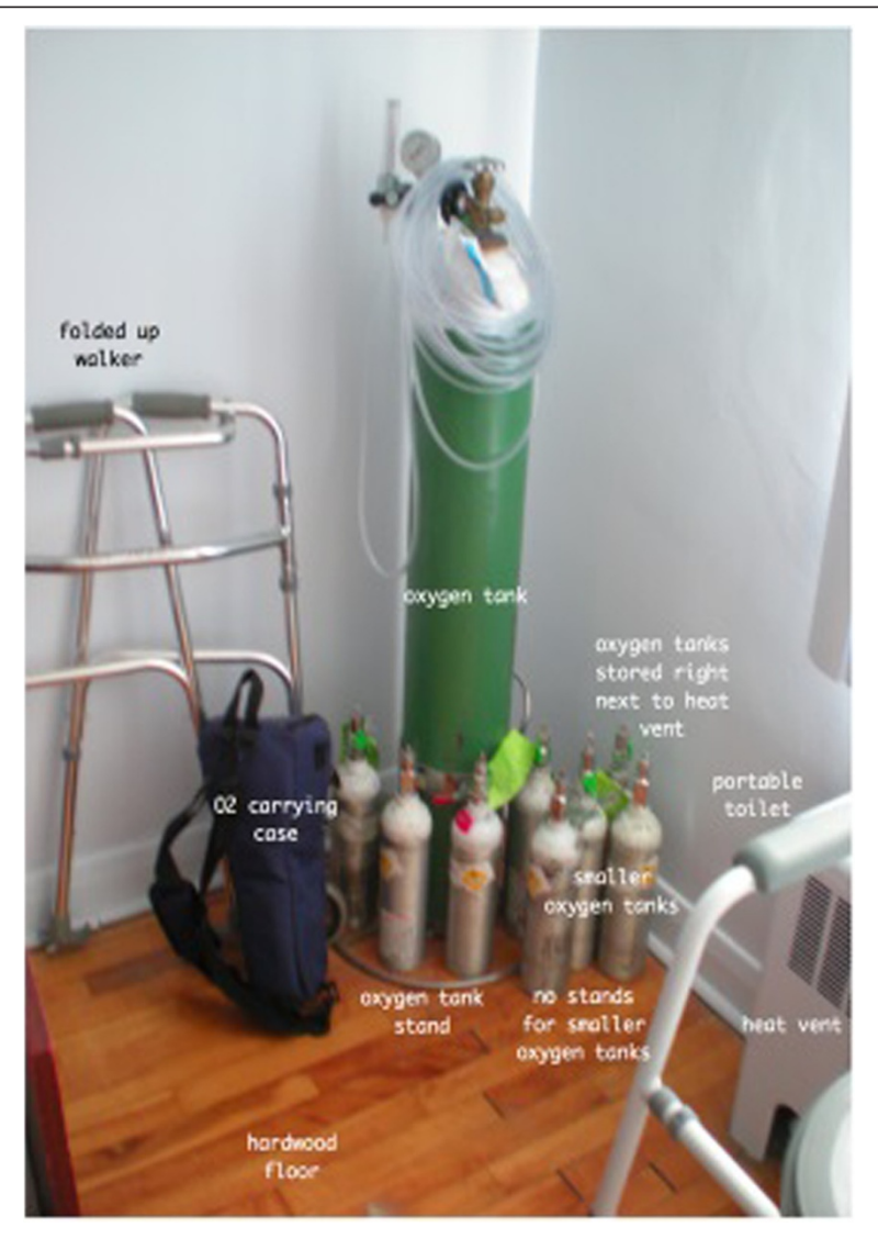
Figure 2 Spare oxygen tanks stored next to a heated vent. The client in this home continued to smoke in the presence of the oxygen.

Helping individuals who were weakened by their disease and in pain to bathe, transfer from the bed to a chair, to the toilet, or between rooms, often caused additional pain and discomfort, albeit unintentional. Indeed, as the client's health deteriorated, typically requiring exponentially more complex and time consuming care, these risks increased as the caregiver became increasingly fatigued and exhausted over the prolonged weeks and months. Furthermore, some of these caring activities placed both clients and caregivers at risk for slips, trips, and injuries.