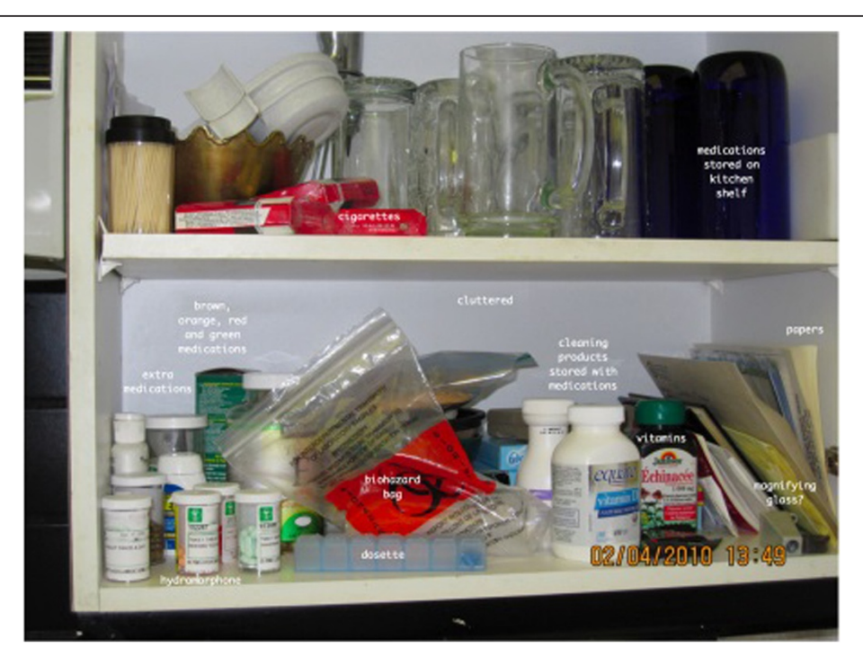
Figure 3 Various types of medications were stored with everyday items such as cleaning products, glasses, plastic containers, cigarettes, a biohazard bag, empty medication containers and paper work.

In addition to caregivers' various pre-existing conditions and chronic illnesses, caregivers also reported persistent fatigue from interrupted sleep patterns due to being constantly vigilant of the client's needs as they were confused, needed pain relief, help repositioning, or assistance with toileting during the night.